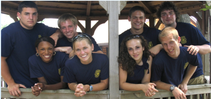
2006 Camp Neidig Outstanding Campers

Each year in June our District Camp Neidig Committee's hard work comes to an exciting conclusion with the holding of this retreat. Intensive sessions in group dynamics, leadership and character development, and the importance of ethnical behavior in one's life pursuits are held. District 7430 Rotarians can be proud of their sponsorships of these young men and women and their families. Giving is not just money. Sometimes the best that we can give is our time, commitment, care, and effort.